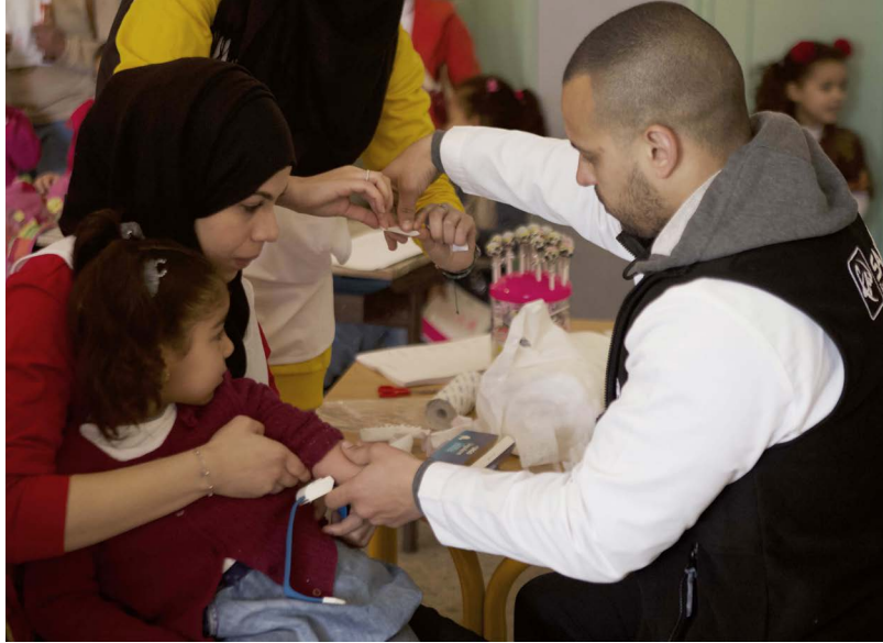
Medical caravan of February 23, 2019 in Marrakech (Es Smara and Ahmed Rachdi schools)

*Decree No. 2.17.648 of October 24, 2017, published in the Official Gazette 6619 of November 6, 2017